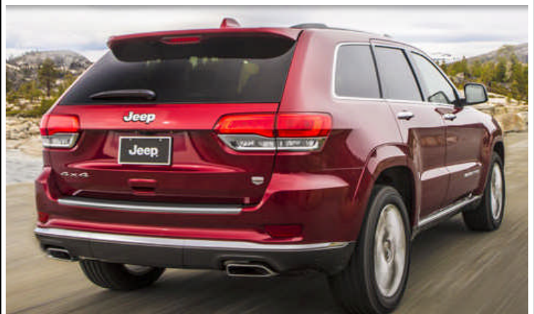
2014 Jeep® Grand Cherokee Summit shown in Deep Cherry Red Crystal Pearl.