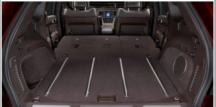
Bright silver strakes in the rear cargo area help you slide your large gear in and keep items from sliding around.