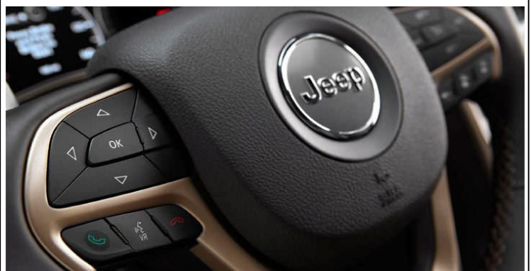
The real wood and leather-wrapped heated steering wheel has fingertip control to control the 7-inch multiview instrument cluster display and available Wi-Fi functions.