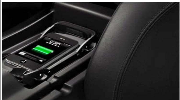
Wireless charging pad