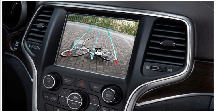
The new ParkView® Rear Back Up Camera* with ParkSense® Rear Park Assist System displays a rearview video image with dynamic distance grid lines when in reverse.