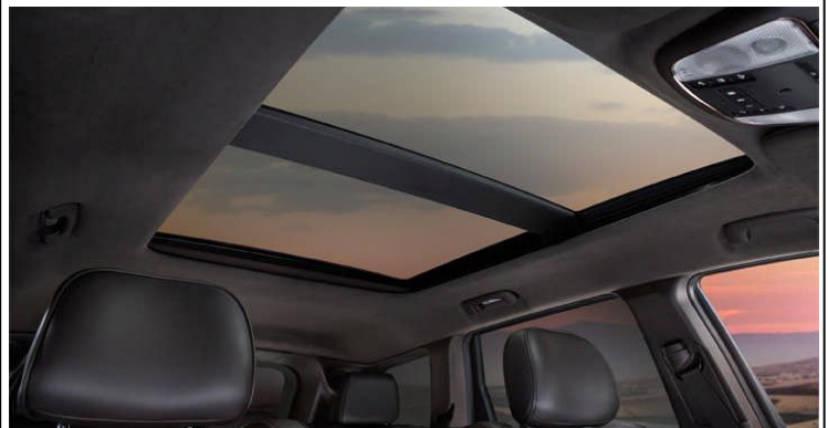
Go wide-screen with this massive CommandView® dual-pane sunroof that includes a dual paned, sliding glass ceiling and power sunshade.

Warranty/Service Contracts 1-800-521-9922